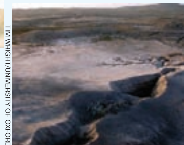
A crevice in the Afar Triangle signals the birth of an ocean. In ten million years this ocean will split the African continent.